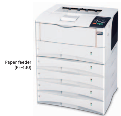
Paper feeder (PF-430)

Product depicted includes optional extras